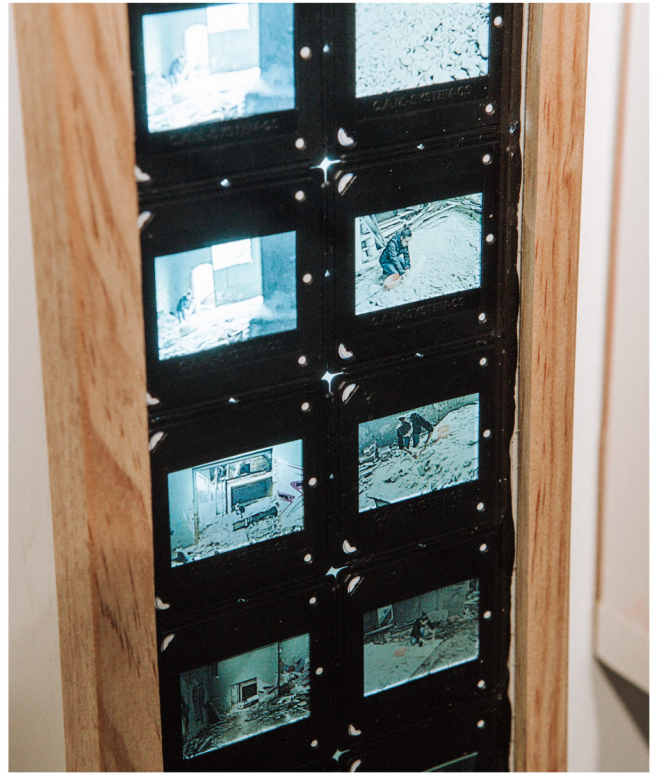
"San Claudio" Display at the Archaeological Museum. Spain 2018