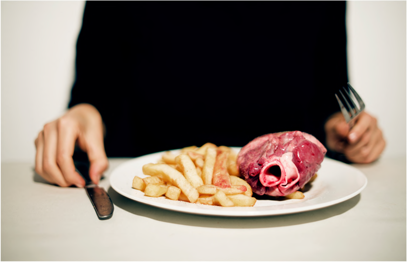
"Heart and Chips" Performance. Bristol, UK 2015