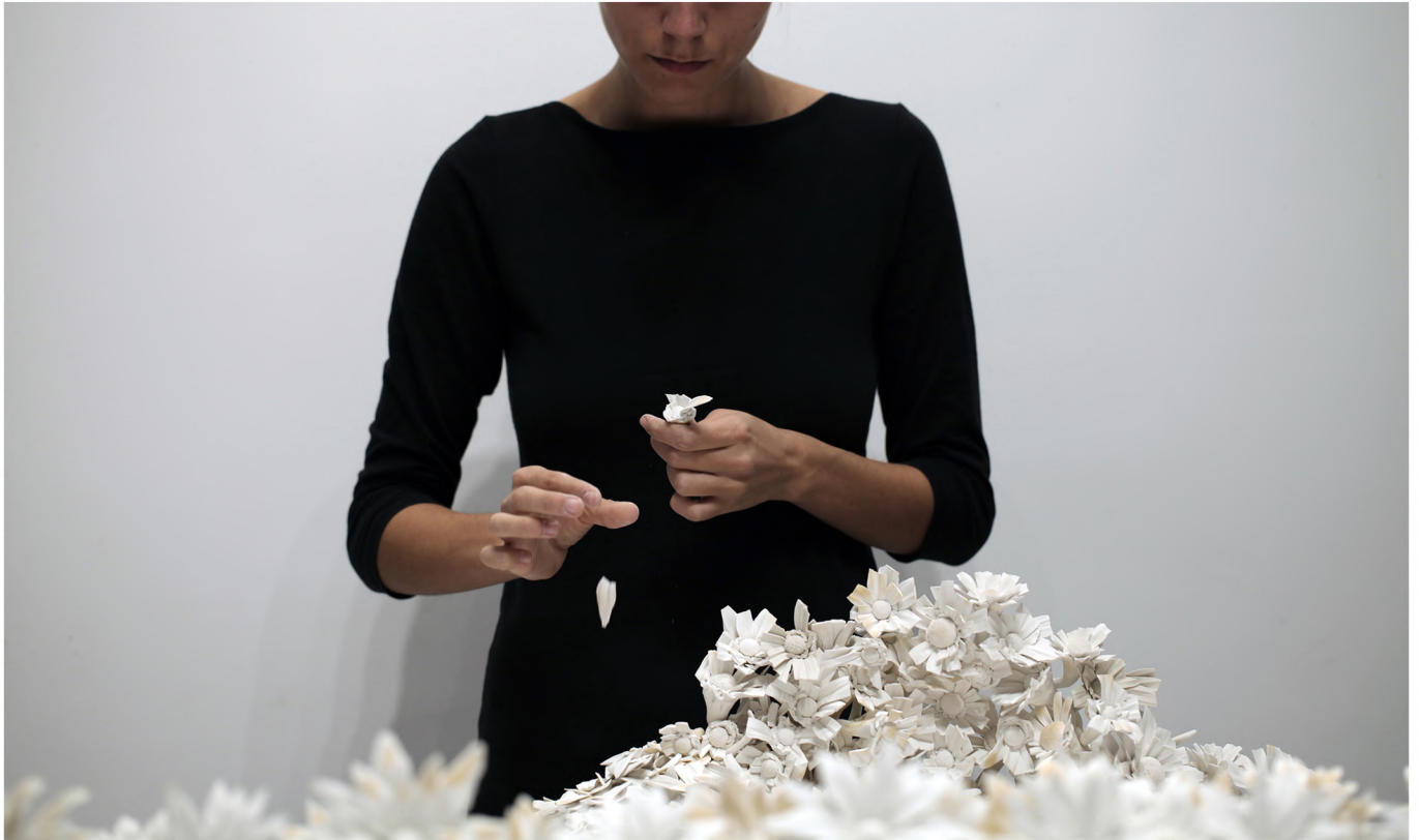
He loves me, he loves me not. Performance. China 2018