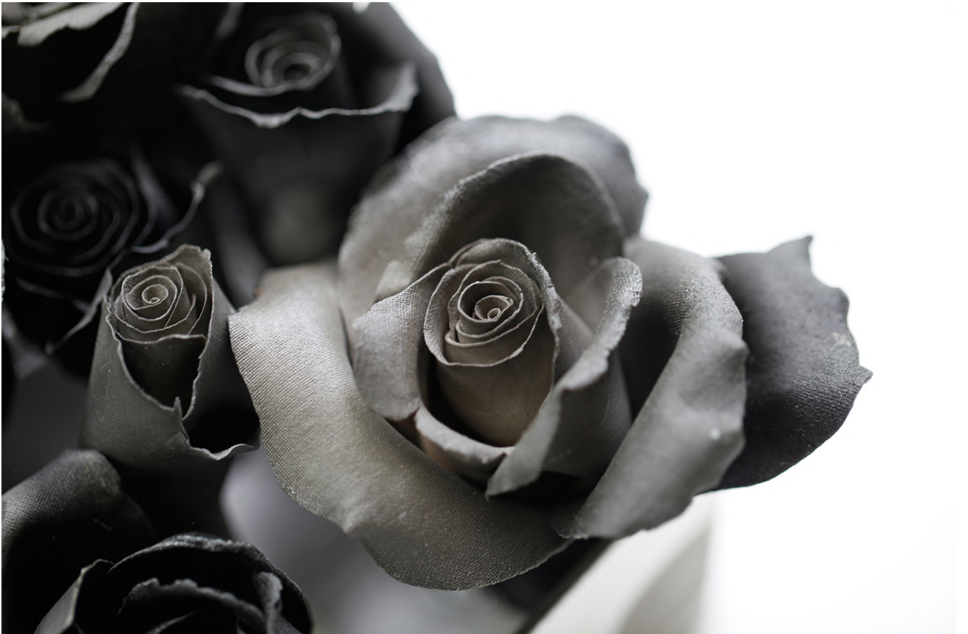
"Isolation". Porcelain and color stein. 200 x 14 x 17 cm. Oxidation 1280 °C. Taiwan 2019