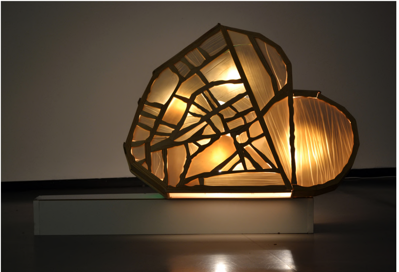
"Summer Boyfriend Wanted" Display at Borron Gallery. Spain 2016