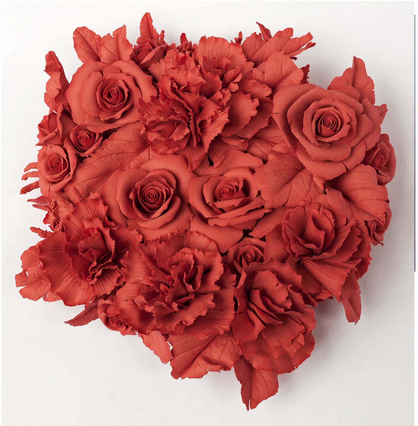
"Rebel Heart" Porcelain and color stein. 30 x 27 x 8 cm. Oxidation 1280 °C. Spain 2019