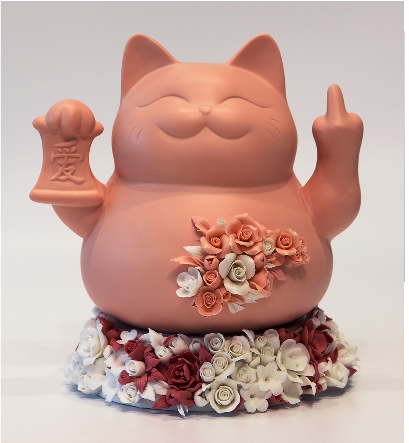
"Diao Ni" Porcelain and color stein. 28 x 30 x 27 cm. Oxidation 1280 °C. China 2018