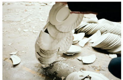
“San Claudio” Performance at the San Claudio Ceramics Factory. Spain 2017