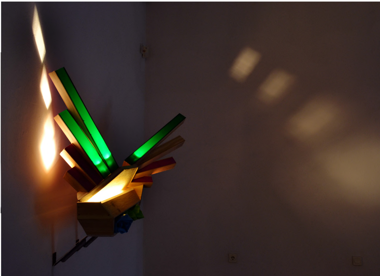
"Summer Boyfriend Wanted" Display at Borron Gallery. Spain 2016