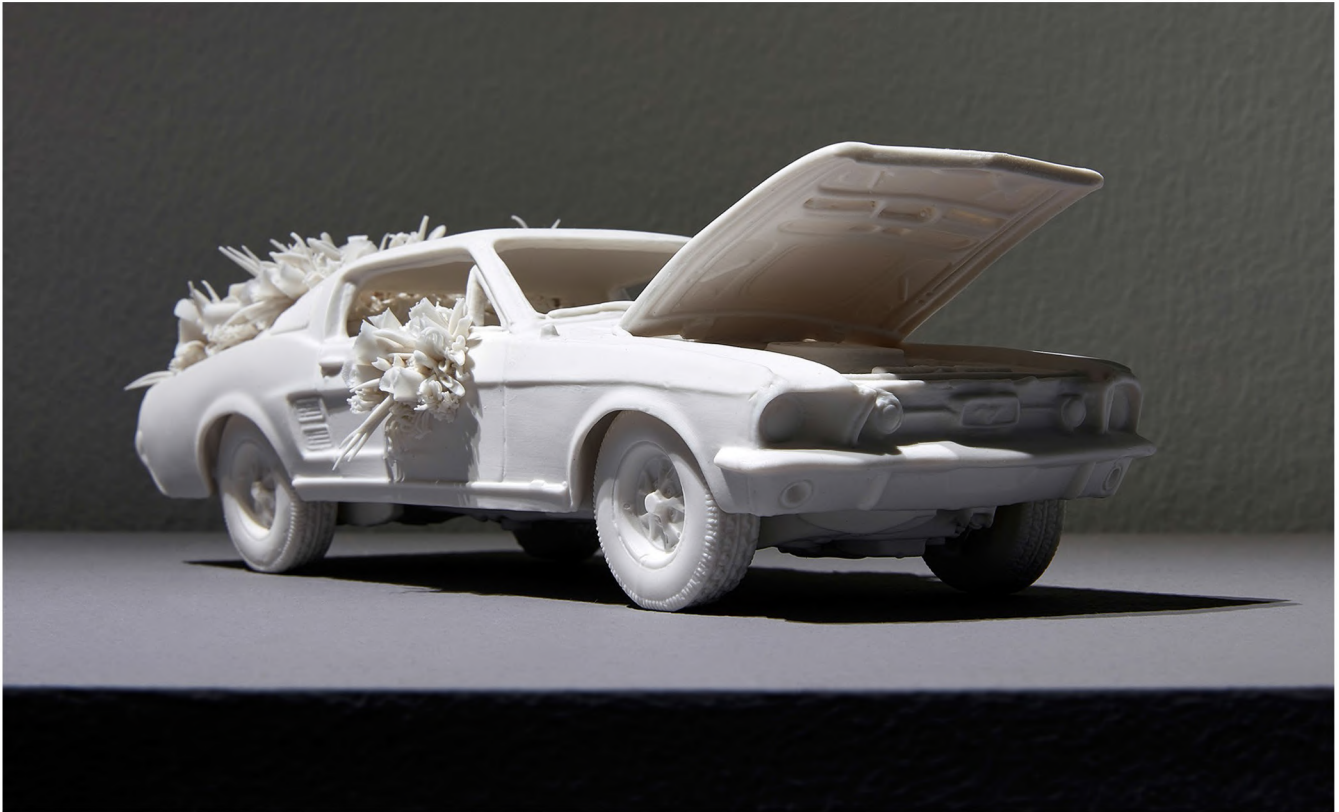
"Everlasting" Display at the Gimhae Clayarch Museum. Korea 2019