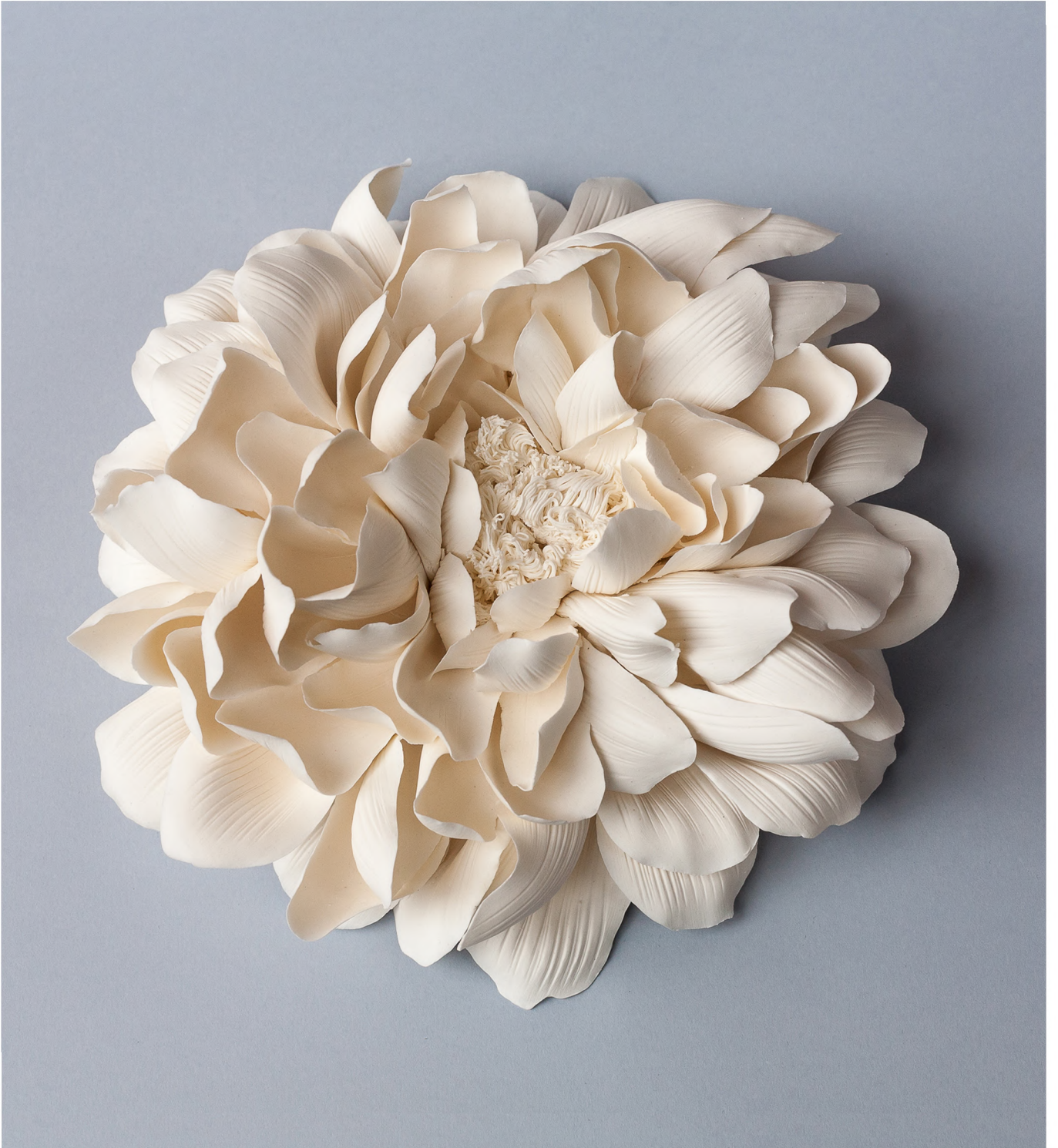
"Peony" Porcelain. 20 x 19 x 9 cm. Oxidation 1280 °C. Spain 2020