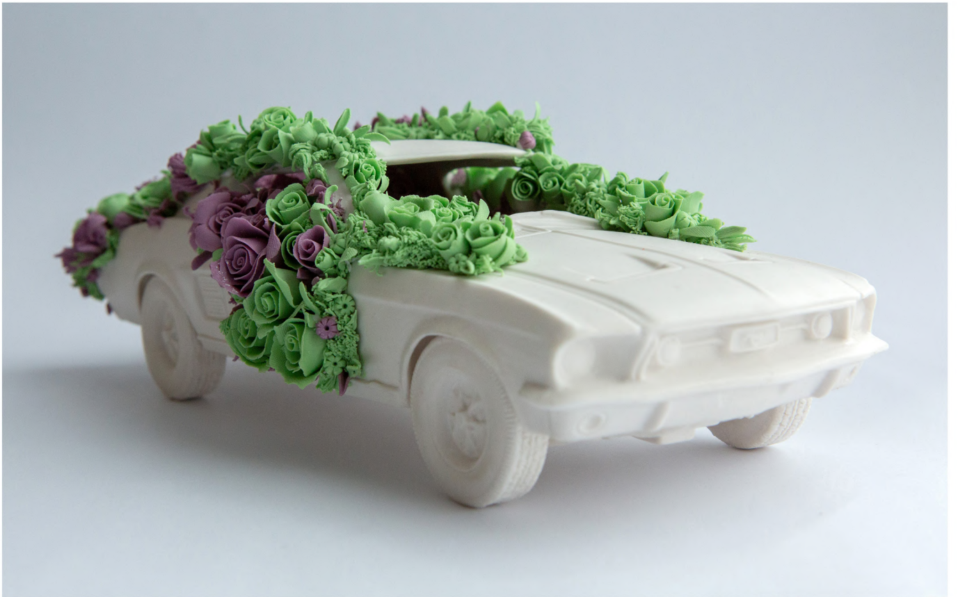
"Everlasting" Porcelain and color stein. 22 x 19 x 11 cm. Oxidation 1280 °C. Korea 2019 The installation is made of 8 individual and original cars.