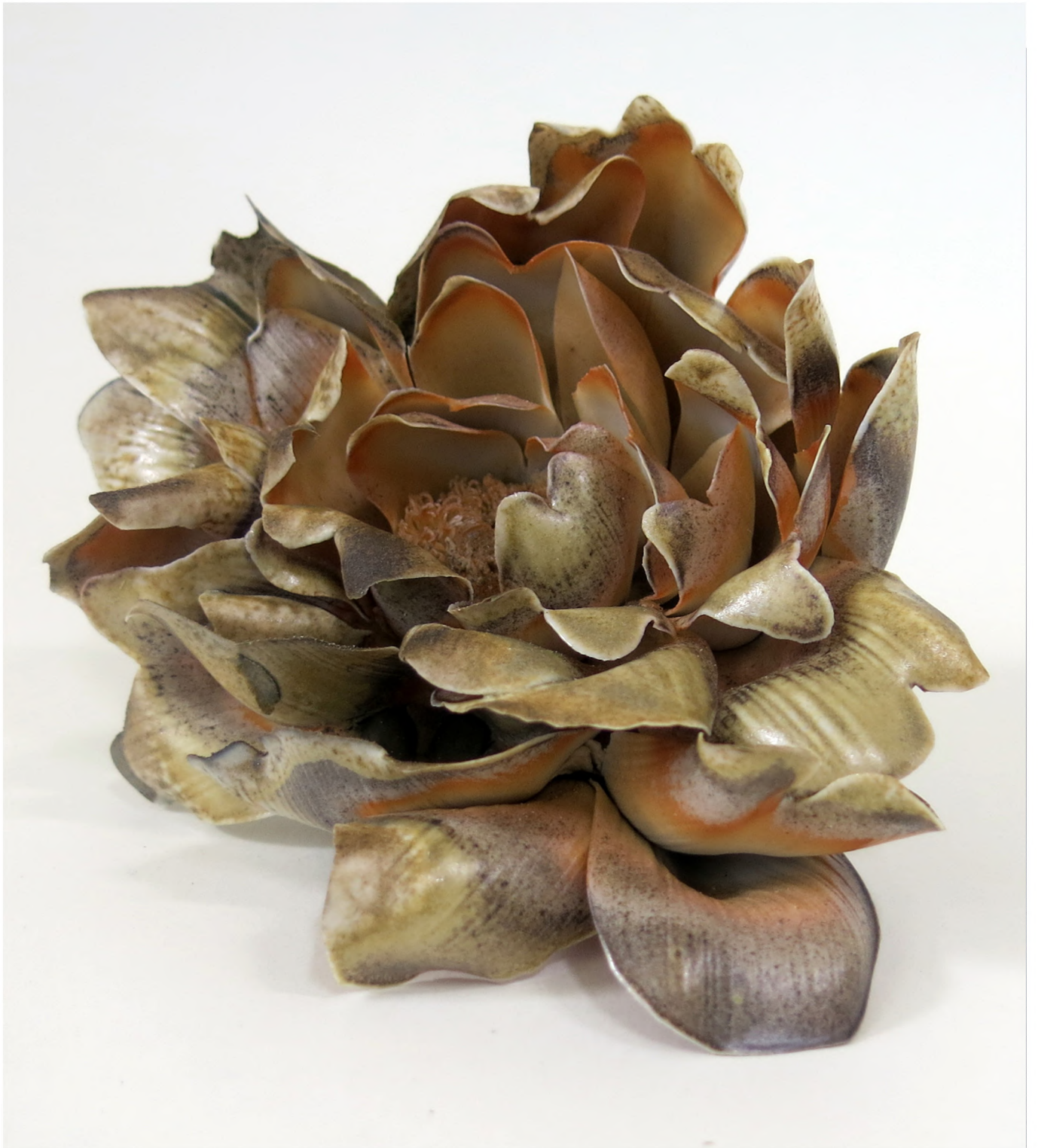
"Tainan" Porcelain. 17 x 19 x 9 cm. Woodfire 1280 °C. Taiwan 2018